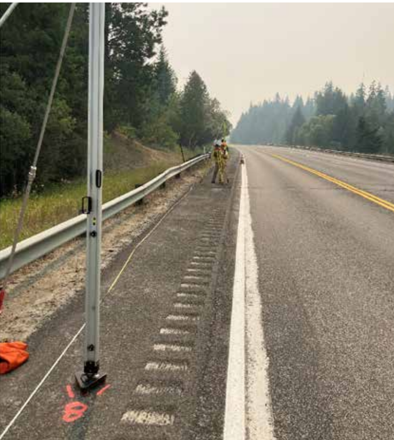
Pictured is Jeannie Liimakka at the Leica DNA03 Digital Level and in the background Craig Mackay on the other Invar Rod. The Leica DNA03 is the standard leveling instrument used by NGS since 2006.

In all, the D5 Crew completed about 8.6 miles of First Order leveling work and found that 7 of 10 marks matched within First Order tolerance. ⊕