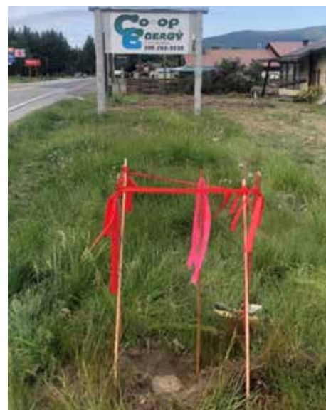
TT 13=BONNERS (PID TO0023)— Found to be low 0.08' will be destroyed by construction and replaced in 2023 or 2024.